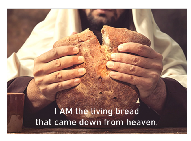
The Most Holy Body and Blood of Christ June 10/11, 2023

Holy Cross: 12704 NE 98th Street Maxwell Iowa 50161