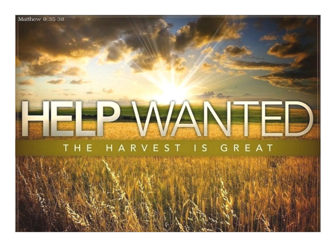
Eleventh Sunday in Ordinary Time June 17/18, 2003

It is customary at St. Mary-Holy Cross after the final song, the assembly kneels and silently prays the "Our Father, Hail Mary, and Glory Be" for the next person of our Parish who dies. Parishioners near death have expressed the comfort they experience knowing the Parish Community is praying for them. Please join us in this sacred prayer.