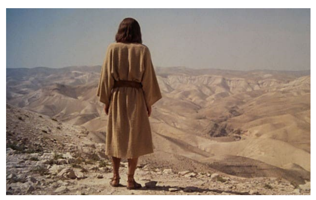
First Sunday of Lent February 17/18, 2024

Holy Cross: 12704 NE 98th Street Maxwell Iowa 50161