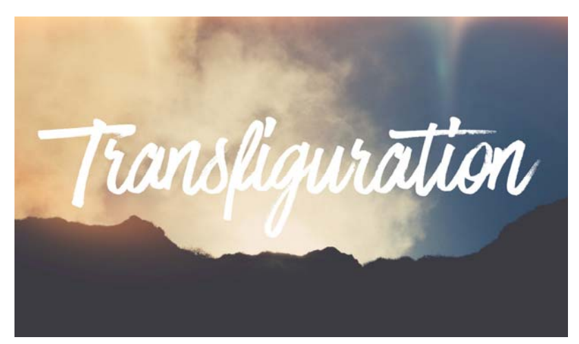
Second Sunday of Lent March 4/5, 2023

460 NW Washington Avenue Elkhart Iowa 50073 Holy Cross: 12704 NE 98th Street Maxwell Iowa 50161