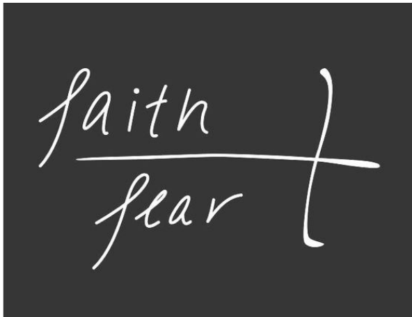
Twelfth Sunday in Ordinary Time June 24/25, 2023

Holy Cross: 12704 NE 98th Street Maxwell Iowa 50161