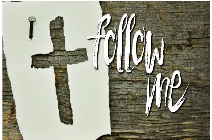
Thirteenth Sunday in Ordinary Time July 1/2, 2023