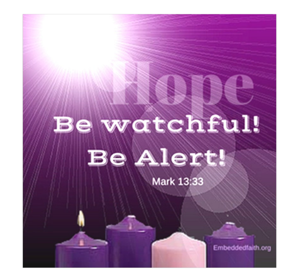
First Sunday of Advent December 2/3, 2023

Our Lord Jesus Christ, King of the Universe November 25/26, 2023