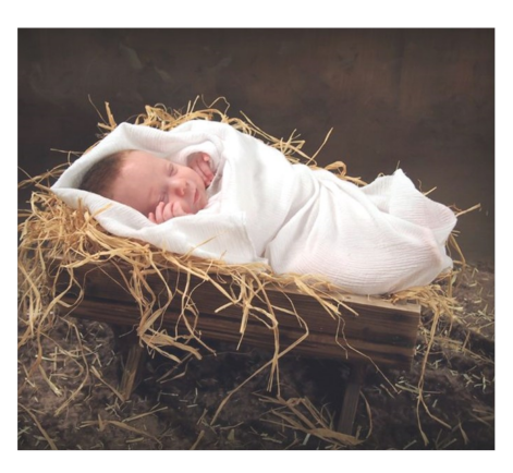
The Nativity of the Lord December 25, 2023