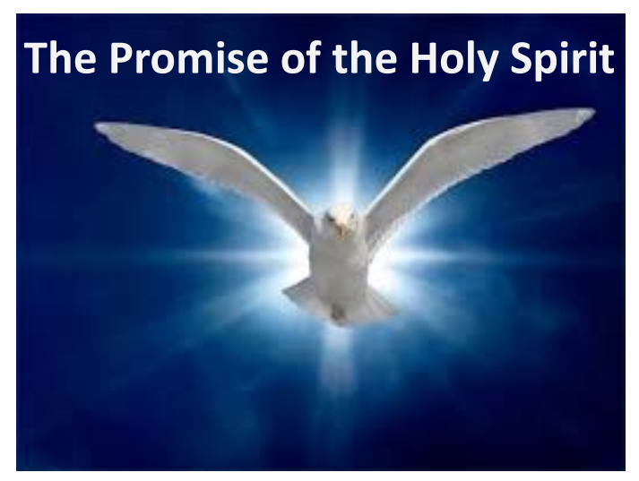
Sixth Sunday of Easter May 13/14, 2023

Holy Cross: 12704 NE 98th Street Maxwell Iowa 50161