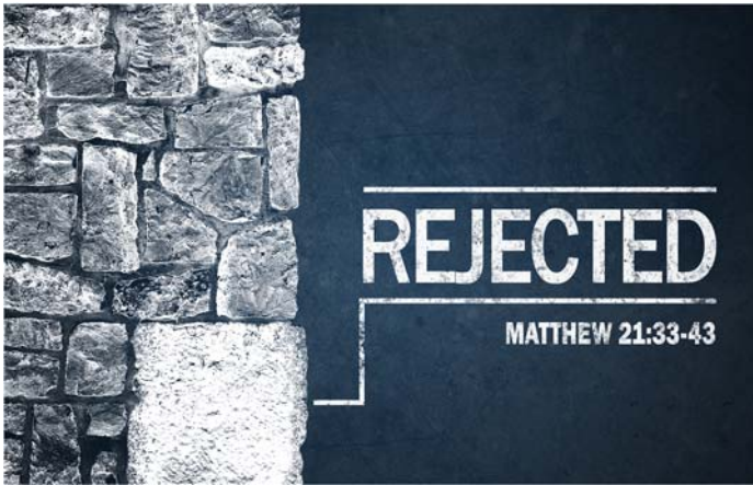
Twenty-seventh Sunday in Ordinary Time October 4, 2020

460 NW Washington Avenue Elkhart Iowa 50073