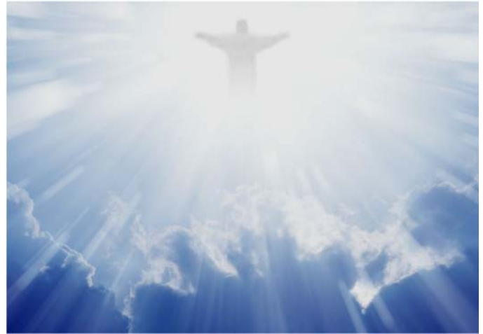
Ascension of the Lord May 13, 2018

It is customary at St. Mary-Holy Cross after the final song, the assembly kneels and silently prays the "Our Father, Hail Mary, and Glory Be" for the next person of our Parish who dies. Parishioners near death have expressed the comfort they experience knowing the Parish Community is praying for them. Please join us in this sacred prayer.