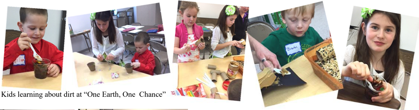
Kids learning about dirt at "One Earth, One Chance"