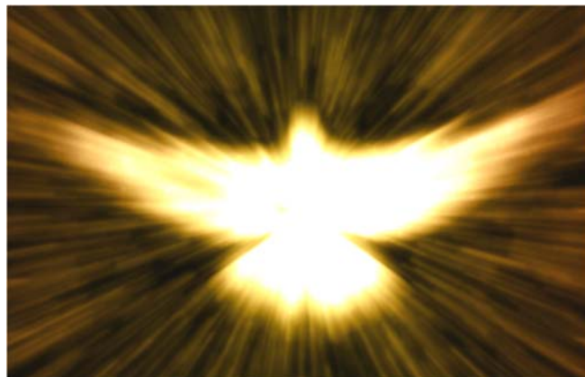
Sixth Sunday of Easter May 25/26, 2019

It is customary at St. Mary-Holy Cross after the final song, the assembly kneels and silently prays the "Our Father, Hail Mary, and Glory Be" for the next person of our Parish who dies. Parishioners near death have expressed the comfort they experience knowing the Parish Community is praying for them. Please join us in this sacred prayer.