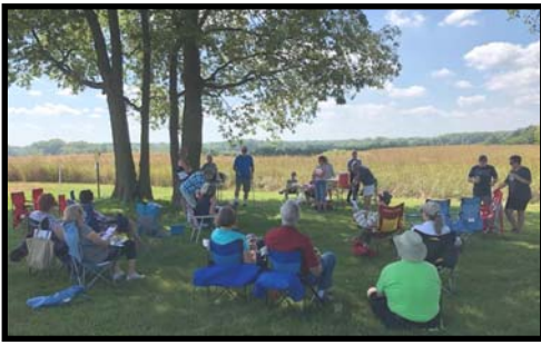
Interfaith Prayer Service