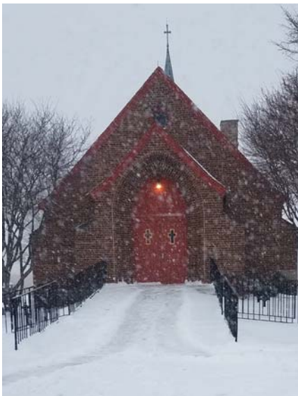
Holy Cross Church on Sunday morning, February 10th