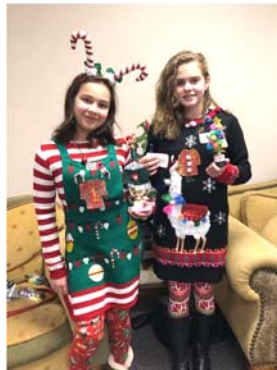
S.T.O.R.M. Christmas Party