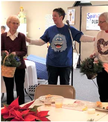
Ladies Christmas Party