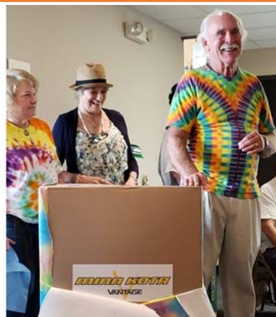
Our favorite hippie Deacon!