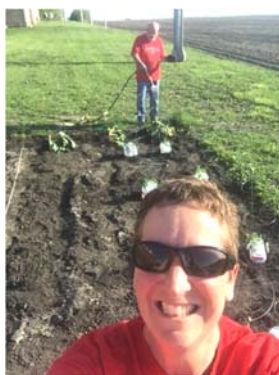
Our hardworking RE students and staff.