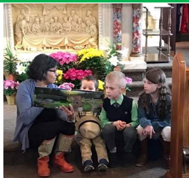
Reading of the Easter Story at Holy Cross