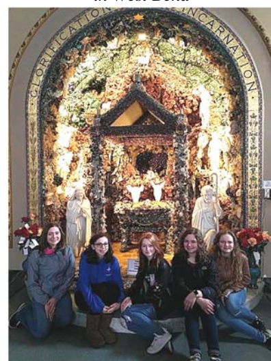
Confirmation students at the Grotto of the Redemption in West Bend

St. Mary-Holy Cross Parish 460 NW Washington Ave PO Box 110 Elkhart, IA 50073