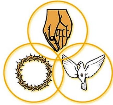
The Most Holy Trinity June 11, 2017

It is customary at St. Mary-Holy Cross after the final song, the assembly kneels and silently prays the "Our Father, Hail Mary, and Glory Be" for the next person of our Parish who dies. Parishioners near death have expressed the comfort they experience knowing the Parish Community is praying for them. Please join us in this sacred prayer.