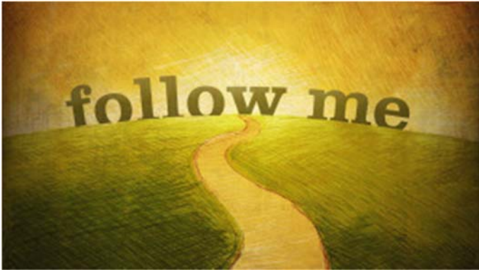
Thirteenth Sunday in Ordinary Time June 29/30, 2019

460 NW Washington Avenue Elkhart Iowa 50073