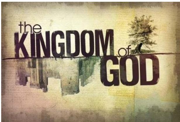
Eleventh Sunday in Ordinary Time June 17, 2018

460 NW Washington Avenue Elkhart Iowa 50073