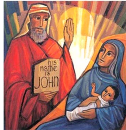
The Nativity of Saint John the Baptist June 24, 2018

It is customary at St. Mary-Holy Cross after the final song, the assembly kneels and silently prays the "Our Father, Hail Mary, and Glory Be" for the next person of our Parish who dies. Parishioners near death have expressed the comfort they experience knowing the Parish Community is praying for them. Please join us in this sacred prayer.