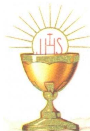
The Most Holy Body and Blood of Christ June 22/23, 2019

It is customary at St. Mary-Holy Cross after the final song, the assembly kneels and silently prays the "Our Father, Hail Mary, and Glory Be" for the next person of our Parish who dies. Parishioners near death have expressed the comfort they experience knowing the Parish Community is praying for them. Please join us in this sacred prayer.