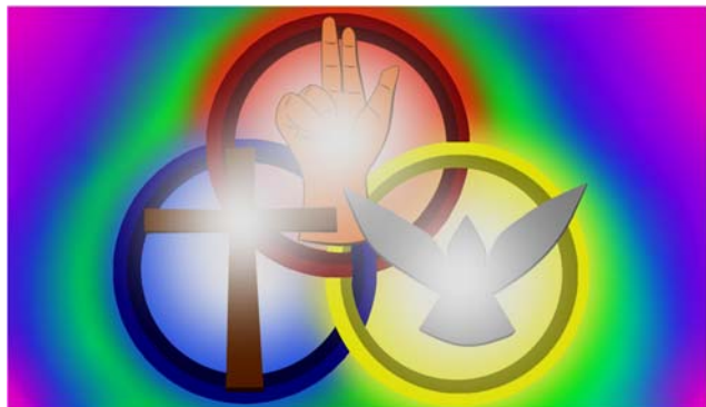
The Most Holy Trinity June 15/16

460 NW Washington Avenue Elkhart Iowa 50073