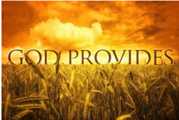
Seventeenth Sunday in Ordinary Time July 29, 2018

460 NW Washington Avenue Elkhart Iowa 50073