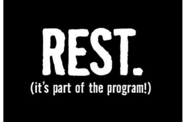
Sixteenth Sunday in Ordinary Time July 22, 2018

It is customary at St. Mary-Holy Cross after the final song, the assembly kneels and silently prays the "Our Father, Hail Mary, and Glory Be" for the next person of our Parish who dies. Parishioners near death have expressed the comfort they experience knowing the Parish Community is praying for them. Please join us in this sacred prayer.