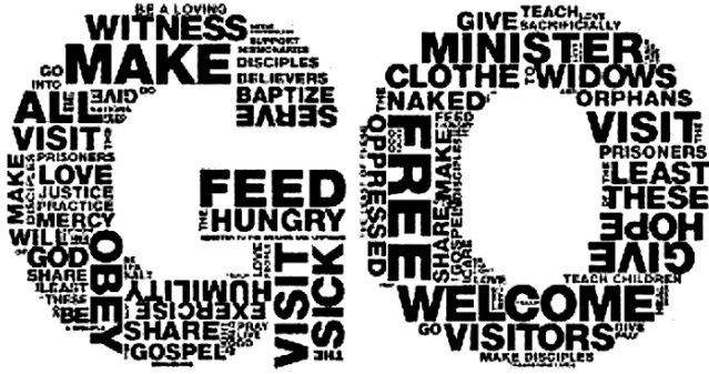
Fifteenth Sunday in Ordinary Time July 15, 2018

460 NW Washington Avenue Elkhart Iowa 50073