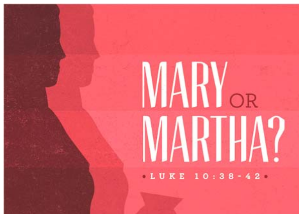
Sixteenth Sunday in Ordinary Time July 20/21, 2019

It is customary at St. Mary-Holy Cross after the final song, the assembly kneels and silently prays the "Our Father, Hail Mary, and Glory Be" for the next person of our Parish who dies. Parishioners near death have expressed the comfort they experience knowing the Parish Community is praying for them. Please join us in this sacred prayer.