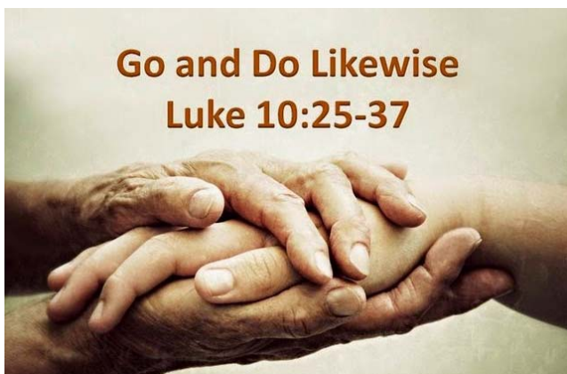
Fifteenth Sunday in Ordinary Time July 13/14, 2019

460 NW Washington Avenue Elkhart Iowa 50073