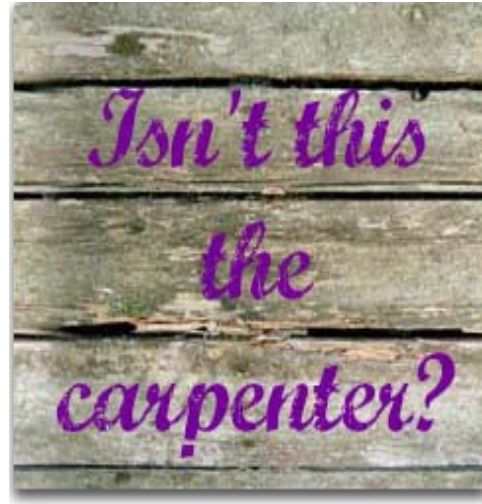
Fourteenth Sunday in Ordinary Time July 8, 2018

It is customary at St. Mary-Holy Cross after the final song, the assembly kneels and silently prays the "Our Father, Hail Mary, and Glory Be" for the next person of our Parish who dies. Parishioners near death have expressed the comfort they experience knowing the Parish Community is praying for them. Please join us in this sacred prayer.