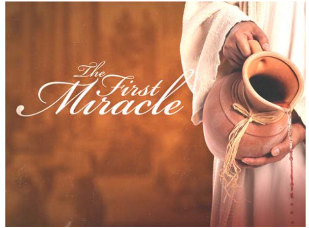
Second Sunday in Ordinary Time January 20, 2019

It is customary at St. Mary-Holy Cross after the final song, the assembly kneels and silently prays the "Our Father, Hail Mary, and Glory Be" for the next person of our Parish who dies. Parishioners near death have expressed the comfort they experience knowing the Parish Community is praying for them. Please join us in this sacred prayer.