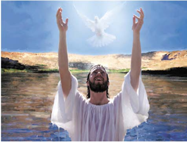
Baptism of the Lord January 13, 2019

460 NW Washington Avenue Elkhart Iowa 50073