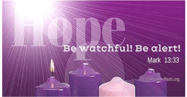
First Sunday Of Advent November 29, 2020

It is customary at St. Mary-Holy Cross after the final song, the assembly kneels and silently prays the "Our Father, Hail Mary, and Glory Be" for the next person of our Parish who dies. Parishioners near death have expressed the comfort they experience knowing the Parish Community is praying for them. Please join us in this sacred prayer.