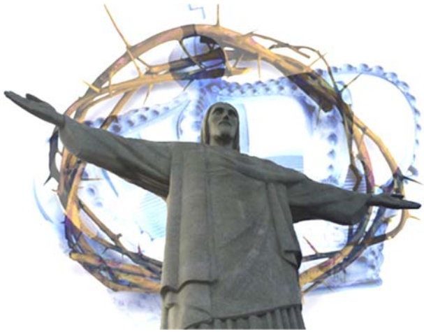
Our Lord Jesus Christ, King of the Universe November 22, 2020

460 NW Washington Avenue Elkhart Iowa 50073