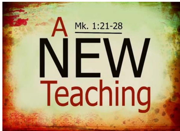
Fourth Sunday in Ordinary Time January 31, 2021

It is customary at St. Mary-Holy Cross after the final song, the assembly kneels and silently prays the "Our Father, Hail Mary, and Glory Be" for the next person of our Parish who dies. Parishioners near death have expressed the comfort they experience knowing the Parish Community is praying for them. Please join us in this sacred prayer.