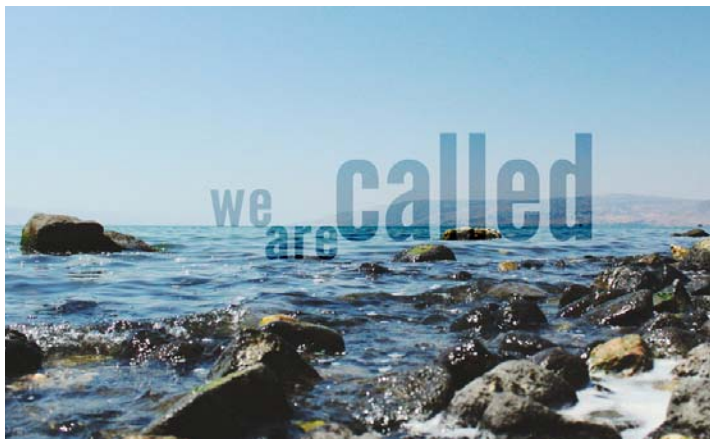
Third Sunday in Ordinary Time January 24, 2021

460 NW Washington Avenue Elkhart Iowa 50073