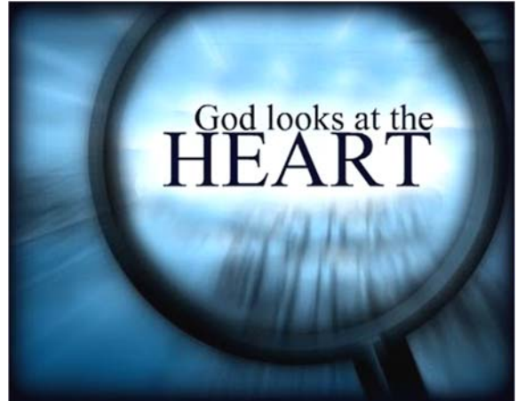
Twenty-second Sunday in Ordinary Time September 2, 2018

It is customary at St. Mary-Holy Cross after the final song, the assembly kneels and silently prays the "Our Father, Hail Mary, and Glory Be" for the next person of our Parish who dies. Parishioners near death have expressed the comfort they experience knowing the Parish Community is praying for them. Please join us in this sacred prayer.