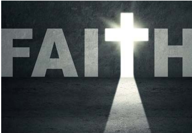
Twentieth Sunday in Ordinary Time August 16, 2020

460 NW Washington Avenue Elkhart Iowa 50073